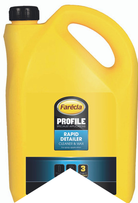
Rapid Wax Liquid hand application $12.00 Foot - Decks