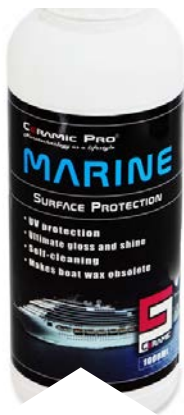
Ceramic Pro glass coating $60.00 +/- Decks