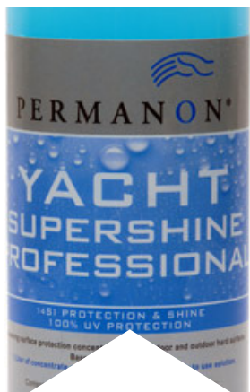
Permanon Super Shine Liquid spray application $7.00 Foot - Decks