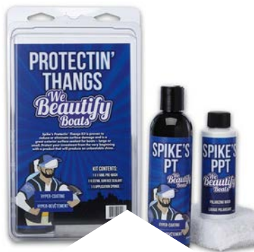
Spike's Protectin' Thangs 2 stage electrostatic app $20.00 Foot - Decks